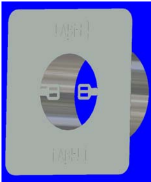
Inside Wall Plate with Tabs & Collar